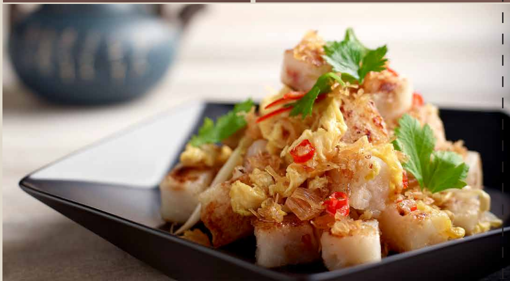
食 206. X.O. 酱萝卜糕 Pan Fried Carrot Cake with X.O. Sauce