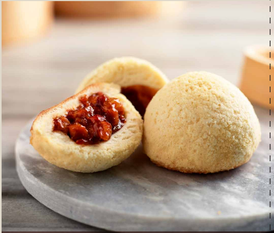
食 203. 雪山叉烧焗餐包 Chef's Special Crispy BBQ Pork Buns