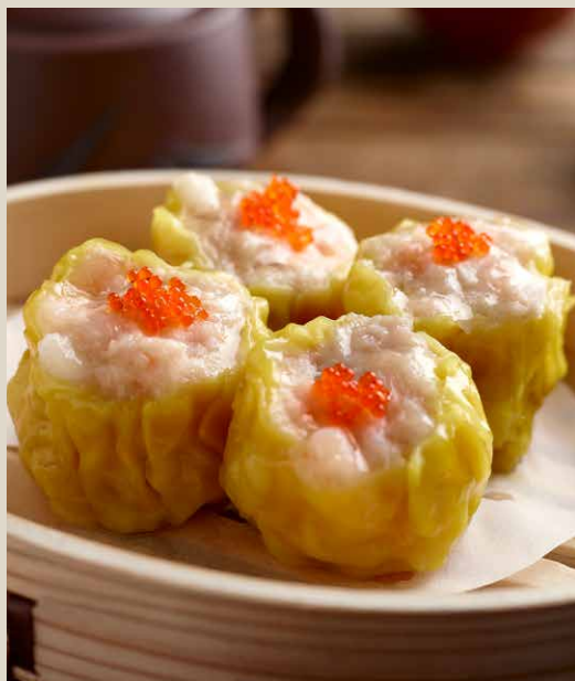
食 101. 珍宝烧卖 JUMBO 'Siew Mai' (Prawn and Pork Dumplings)