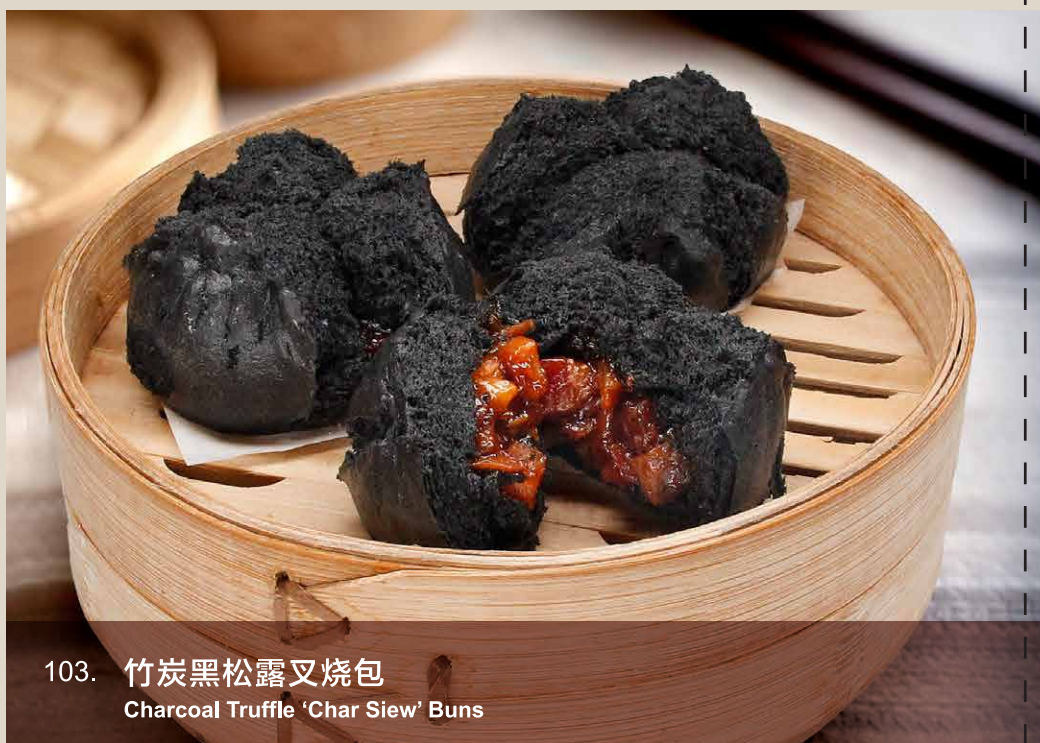
103. 竹炭黑松露叉烧包 Charcoal Truffle 'Char Siew' Buns