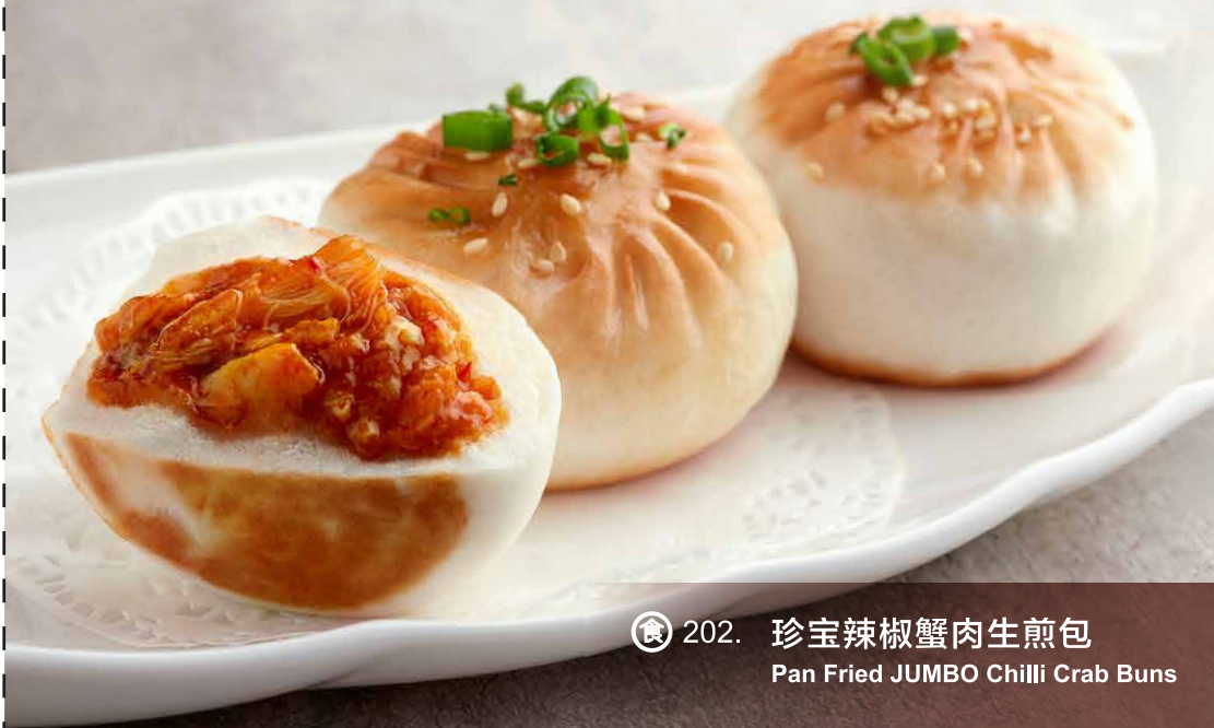
① 202. 珍宝辣椒蟹肉生煎包 Pan Fried JUMBO Chilli Crab Buns