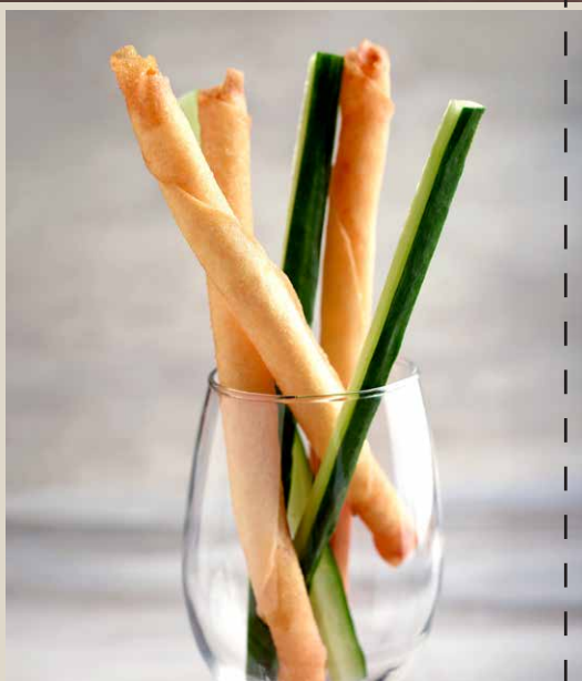
食 209. 鲜虾雪茄春卷 Crispy Fried Cigar Spring Rolls Stuffed with Prawns