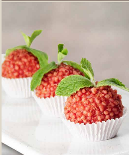
210. 脆炸荔枝虾球 Crispy Lychee Prawn Balls