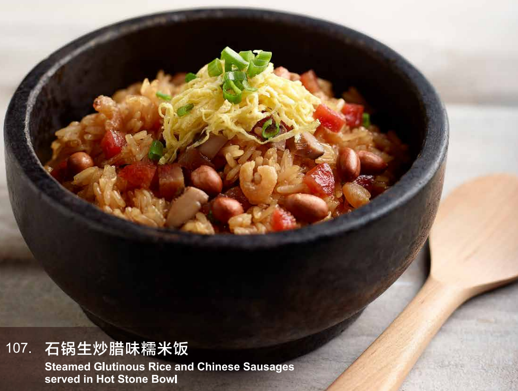
107. 石锅生炒腊味糯米饭 Steamed Glutinous Rice and Chinese Sausages served in Hot Stone Bowl

服务费与消费税另计。Prices are subject to service charge and prevailing GST。 | 照片只供参考使用。Photos are for illustration purposes only。 | 我们的食物可能含有或接触过（包含但不限于）牛奶，鸡蛋，鱼，贝类，坚果，花生，小麦和大豆。如果您有任何担忧，请与我们的服务员联系。Our food may contain or come into contact with (but not limited to) milk, eggs, fish, shellfish, tree nuts, peanuts, wheat and soybeans. Please speak to our service staff if you have any concerns. | 招牌菜 Signature Dish