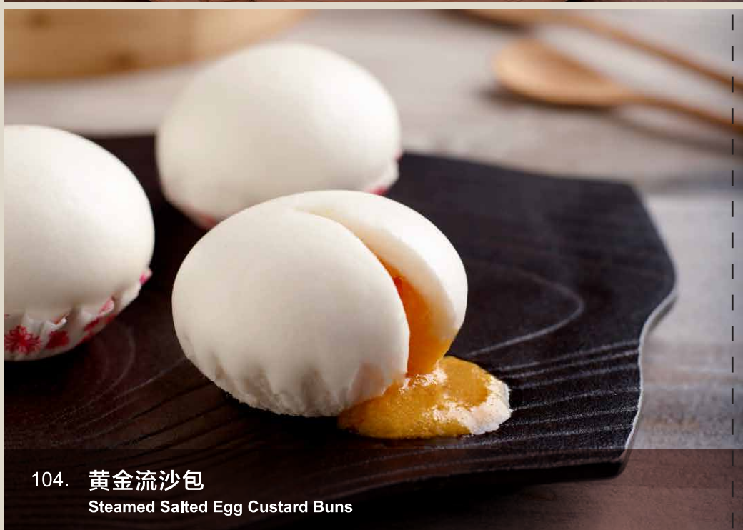
104. 黄金流沙包 Steamed Salted Egg Custard Buns